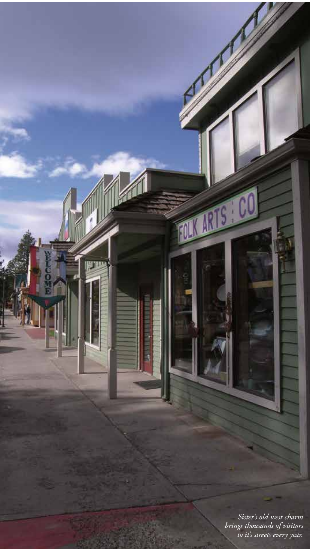
Sister's old west charm brings thousands of visitors to its streets every year.