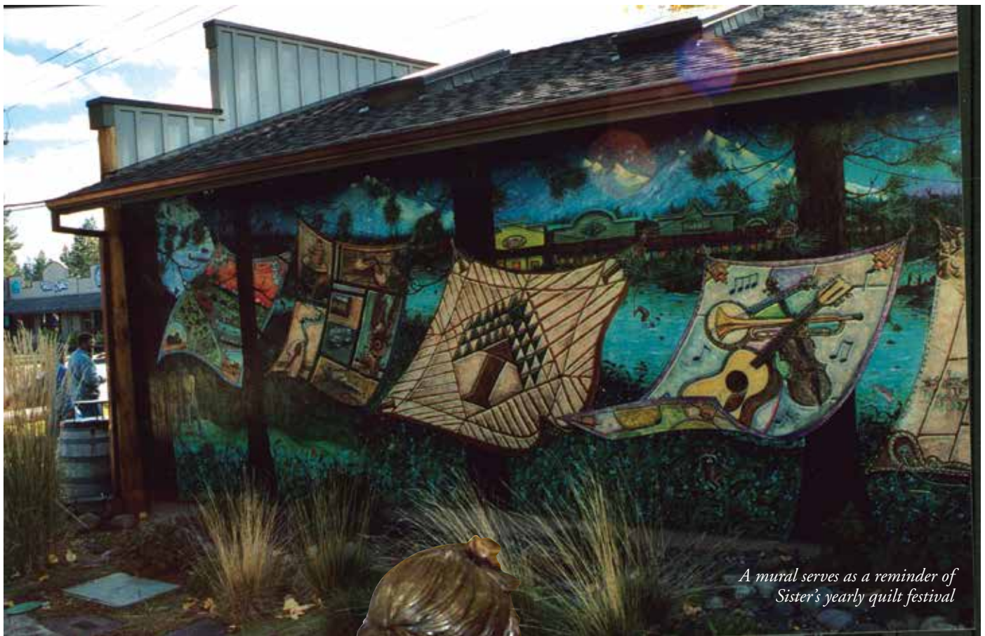
A mural serves as a reminder of Sister's yearly quilt festival

“We are really enjoying Sisters and the small town feel. This town is so small—1,490 people—and so much is going on.”